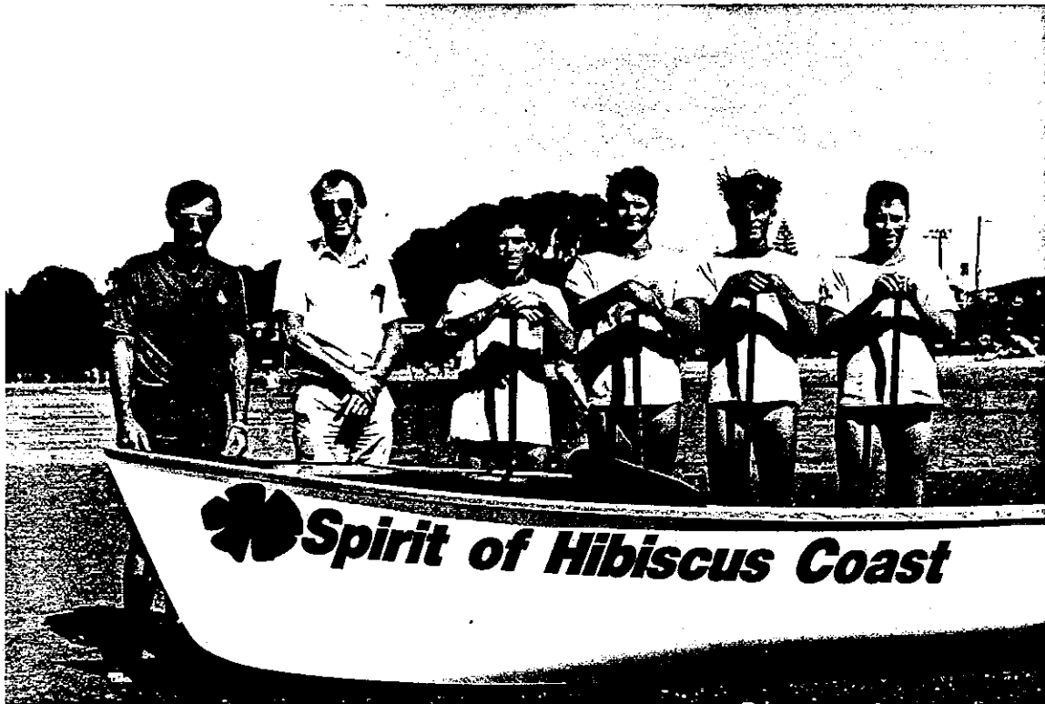
The launch of "Spirit of Hibiscus Coast" on 26.3.89