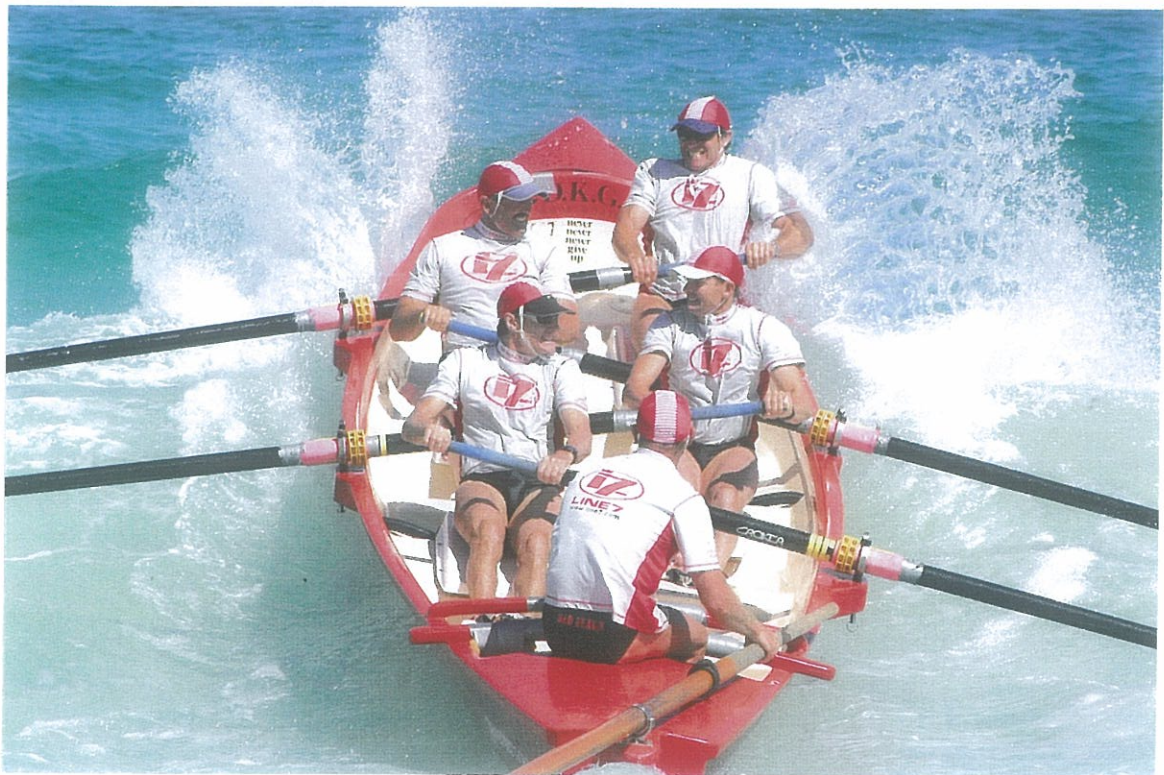
The Red Beach 'Cab Savs' Masters surf boat crew in action at the Australian Championships, Scarborough Beach, Perth in March 2007.