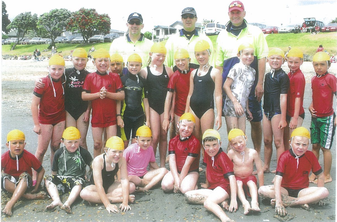
JuniorSurf members and coaches during a Sunday morning training session at Red Beach. The club had a record intake of JuniorSurf members during the 2006/07 season.