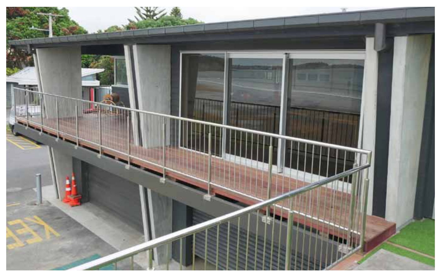
The deck extension at the club which became available for use in December 2019.