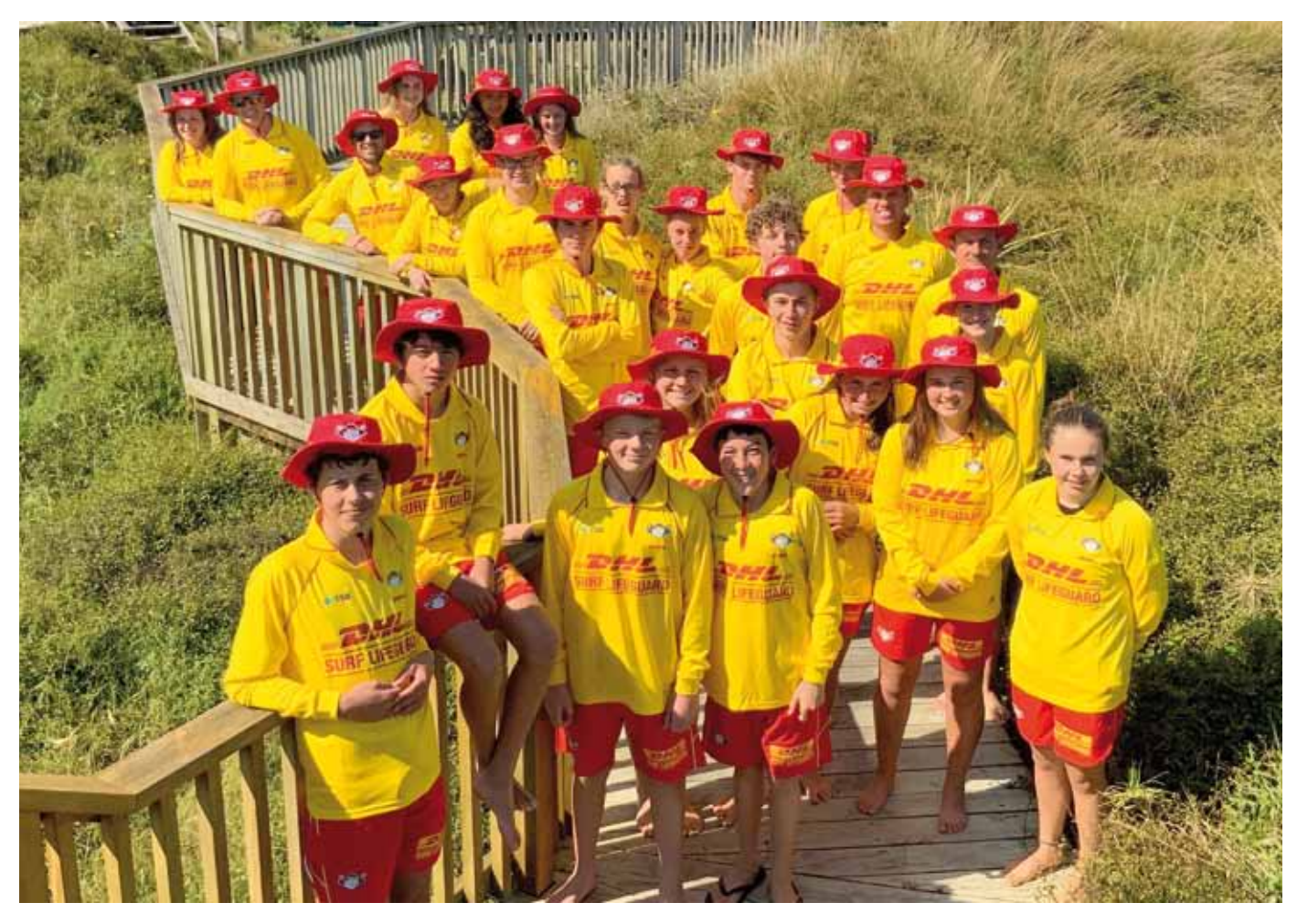
Red Beach club members who obtained the Surf Lifeguard Award in November 2019.

First Aid Level 2 Refreshers: 12 First Aid Level 3 Refreshers: 1