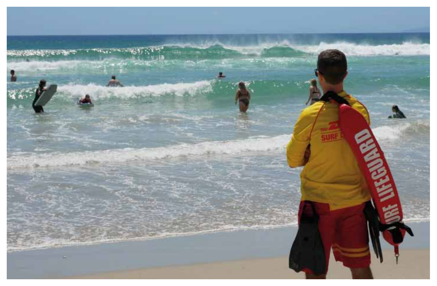
Patrolling at Pakiri, December 2019.