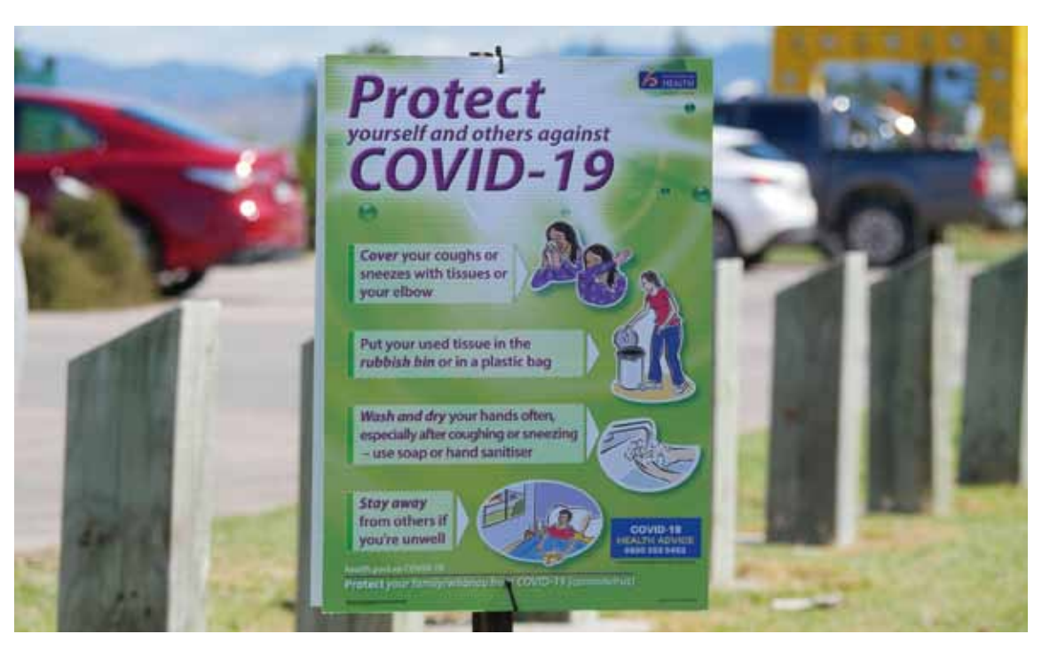
A familiar sight at the National Championships in mid-March. If the event had been scheduled to take place a week later, it would have been cancelled.