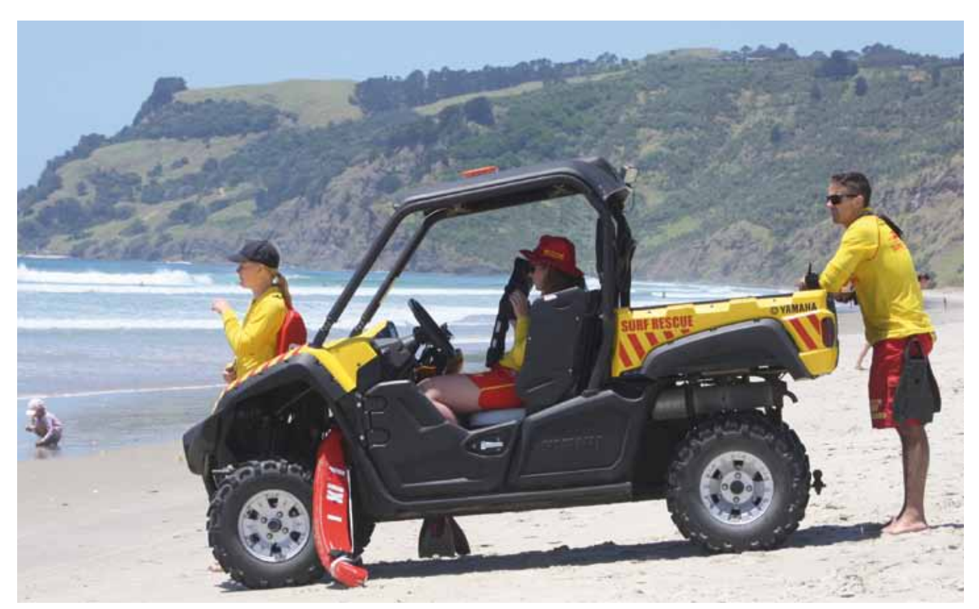
Club lifeguards on patrol at Pakiri, December 2019.